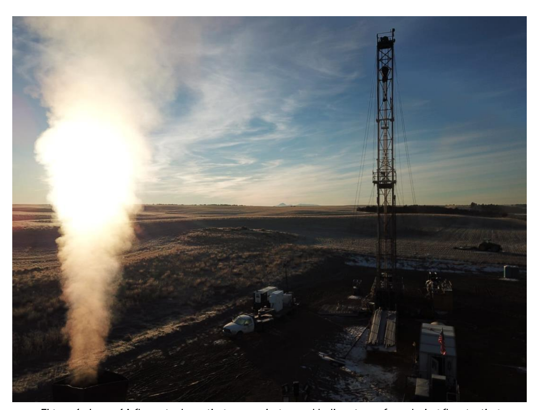
Figure 1: Jesse-1A flare-stack venting reservoir gas and helium to surface during flow-testing